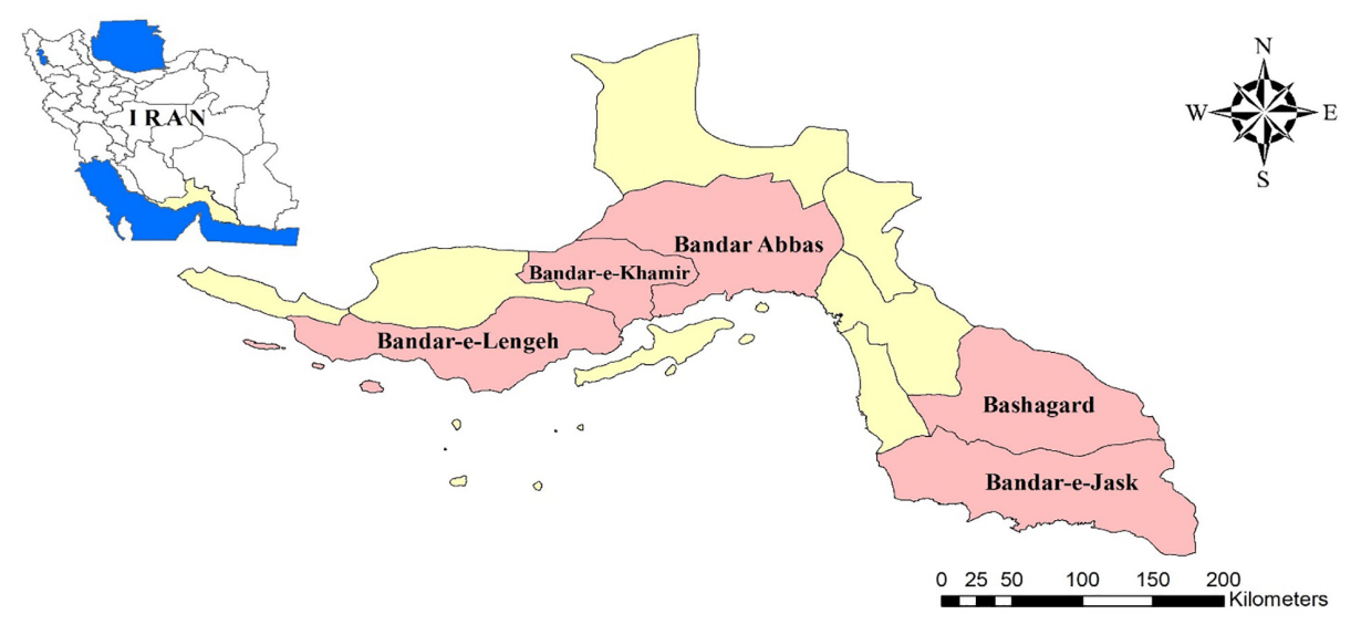
Figure 1: Study areas in Hormozgan province, Southern Iran.

In the present study, in 2017, five locations with different habitats in five cities of Bandar Abbas, Bandar Khamir, Bandar Jask, Bandar Lengeh, and