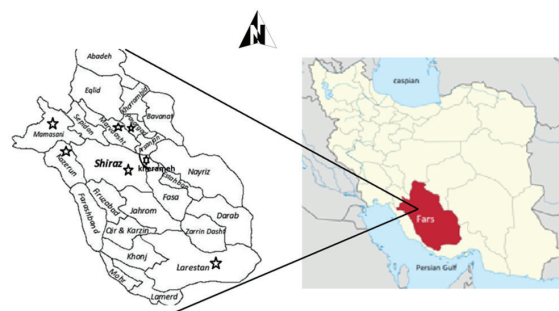
Figure 1: Location of the study areas in Fars province, Southern Iran, 2019. ☆ Indicated the study area

Procedure: Samples were collected from Kherameh, Marvdasht, Kazeroon, Shiraz, Larestan, Mamasani, Zarrin Dasht, and Pasargad districts twice a year, using indoor and outdoor sticky-traps, spring season from mid-May to late June and summer from mid-August to late September in indoor and outdoor