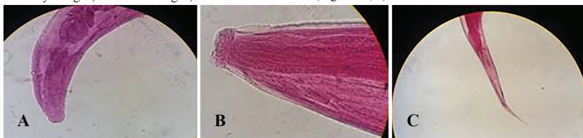
Figure 1: Syphacia obvelata obtained from C. bailwardi . A: Male anterior end. B: Female anterior end C: Female posterior end (Carmine staining)

Amongst 10 examined specimens, 6 cases (60%) were found to be infested with the endoparasite. In this study, the only helminth which was infecting the Calomyscus cf. bailwardi was Syphacia obvelata (Figures 1, 2).