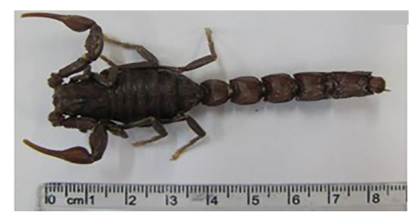
Figure 2: Androctonus crassicauda (Original Picture)