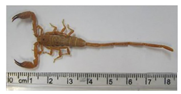
Figure 3: Hemiscorpius lepturus ♂ (Original Picture)