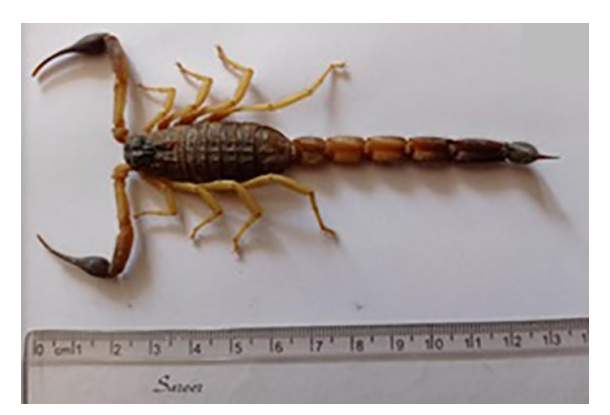
Figure 6: Hottentotta jayakari: (Original Picture)