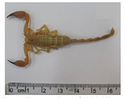
Figure 4: Hemiscorpius lepturus ♀ (Original Picture)