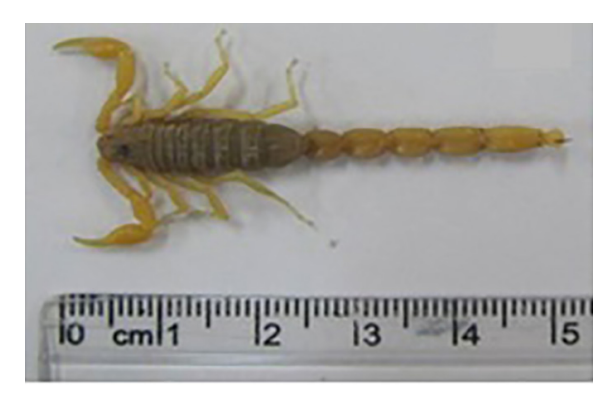
Figure 5: Mesobuthus eupeus (Original Picture)