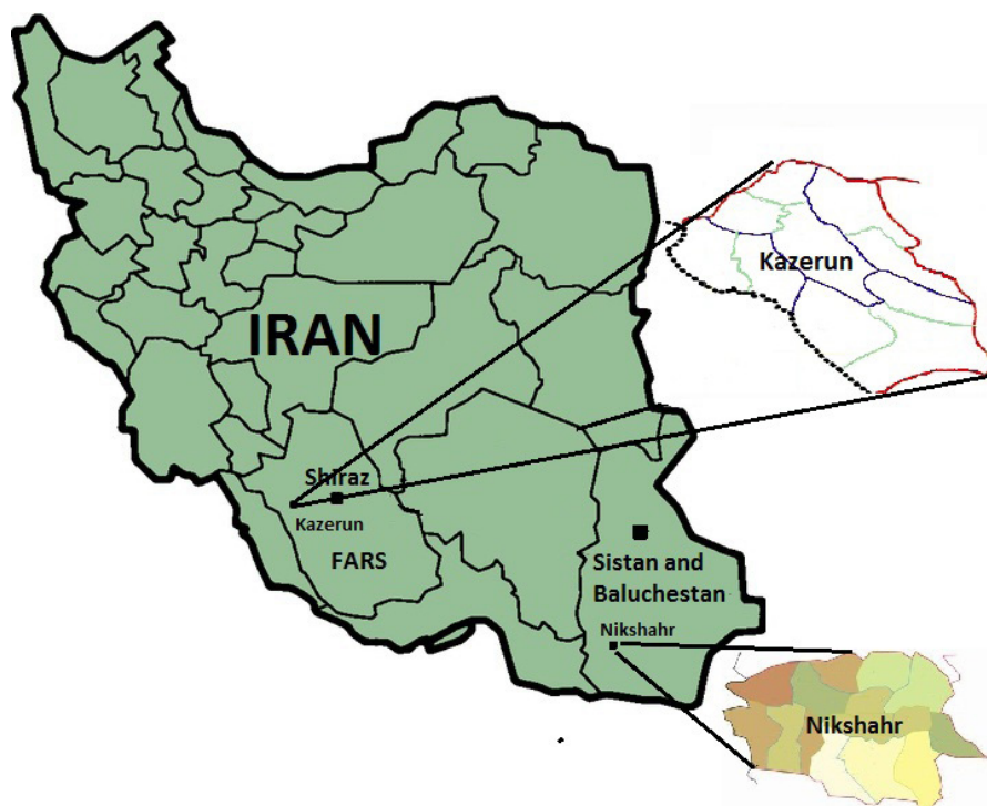
Figure 1: Map of Iran shows the location of study sites in Nikshahr and Kazerun cities, south Iran.

The first part of this study for susceptibility tests of three different pyrethroid insecticides on field-collected adult female mosquitoes of An. stephensi ( mysoriensis strain) was carried out in the city of Nikshahr which is located at 60°12'E, 26°12'N at an altitude of 510 meters above the sea level (Figure 1).