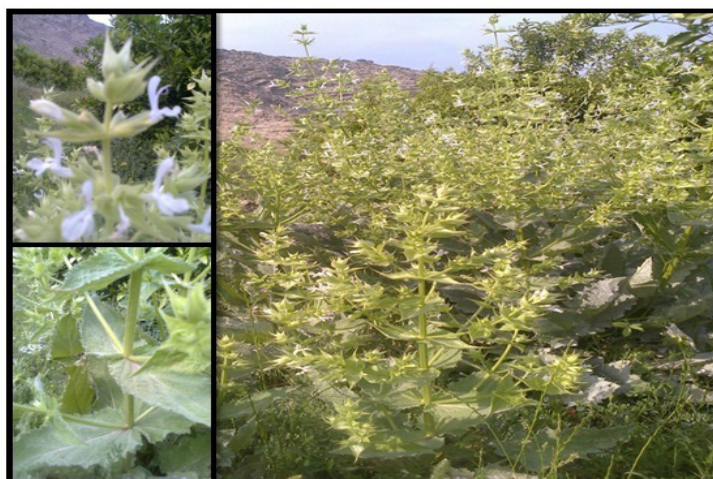
Figure 2: The Clary sage, Salvia sclarea , grows naturally in its native habitat of Cheram district, Iran.

Following earlier tests on malaria vector mosquitoes, 28 an exposure chamber was prepared with dimensions of 70×70×70 cm and a small (radius=5cm) entry hole equipped with a short (15 cm long) netting sleeve on the outside for leading the house flies into the system and a window trap cage on the opposite side measuring 30×30×30 cm, all made up of fiberglass (Figure 3).