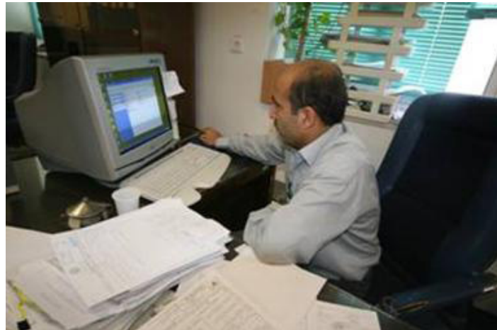
Figure 2: A very common working posture among office staff. Shoulders, upper arms and elbows are in awkward postures. Head, neck and back are rotated.

*Mann-Whitney U; † neck, shoulder, wrist/ hand, back and lower back; EWC=Environmental working conditions; WS=workstation design; WP=working posture; TE=total ergonomics index