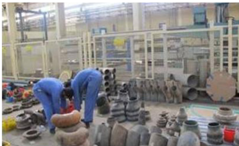
Figure 3: Two workers are involved in manual handling of heavy loads. Total QEC score is 82% indicating very high risk level.

common among the studied employees. Back, neck, knees, shoulders and wrists symptoms were found to be the most prevalent problems among the workers studied.